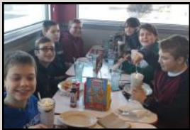
The Bolt Patrol enjoying Steak 'n Shake at their patrol outing.