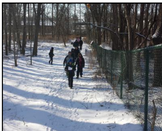
The Bolt Patrol hiking in Cool Creek Park.

The Noble Knights had a patrol outing on December 2. They went ice-skating at Federal Hill Commons ice skating rink.